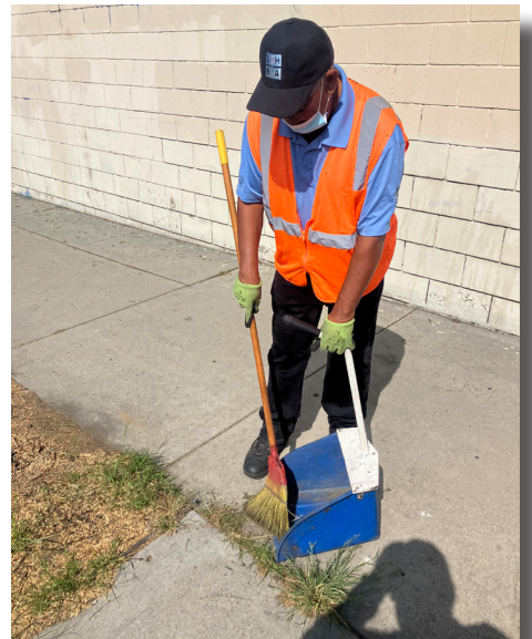
Lincoln Heights Chrysalis sweeper taking care of the sidewalks